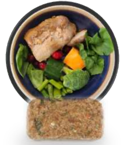
Individually Wrapped Portioncontrol food bars convenient for thawing and feeding

My Perfect Pet 49 Pioneer Parkway Sulphur Springs, TX 75482 858-486-6500 MyPerfectPet.com